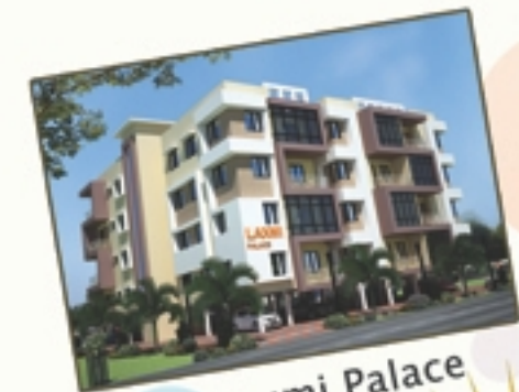
Laxmi Palace at Naharakanta