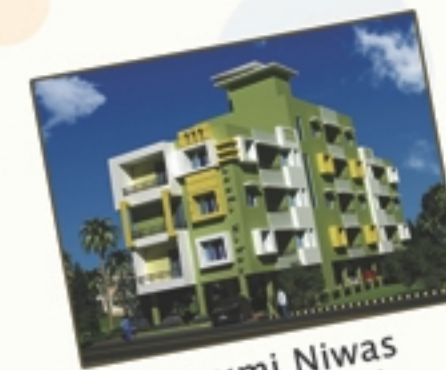
Laxmi Niwas at Forest Park