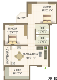
2BHK SUPER BUILT UP AREA : 1261 SQ. FT CARPET AREA : 839 SQ. FT