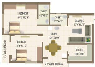
2BHK SUPER BUILT UP AREA : 1192 SQ. FT CARPET AREA : 797 SQ. FT