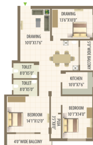
3BHK SUPER BUILT UP AREA : 1633 SQ. FT CARPET AREA : 1108 SQ. FT