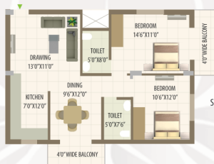
2BHK SUPER BUILT UP AREA : 1186 SQ. FT CARPET AREA : 797 SQ. FT